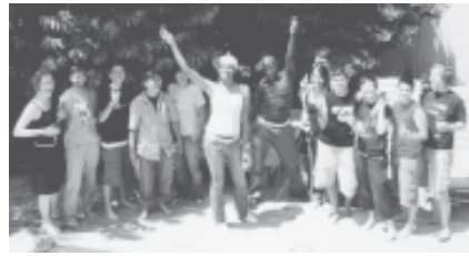
The SRLP Collective retreat on Fire Island (above). SRLP's July house party for friends and supporters of the organization (left). Our office warming party in May at our new space in Chelsea (below).