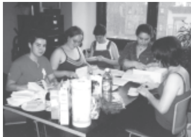
Volunteers mailing out all 1200 fundraising letters.