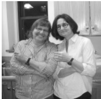
Our gracious hosts from our last two fundraising parties at their home.